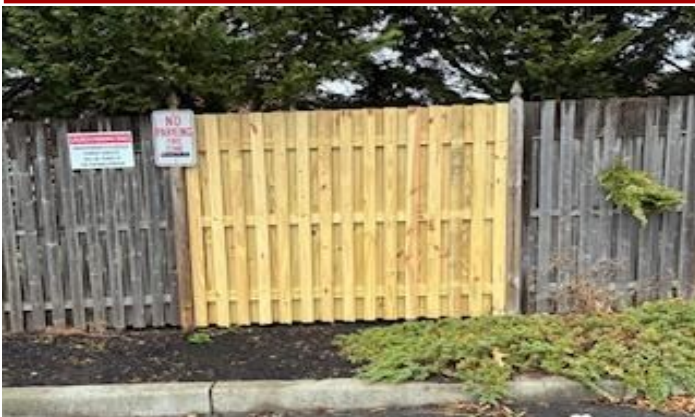
Fencing repair at St. Paul's

Lots of Burgers, soda, water chips and prizes!!!