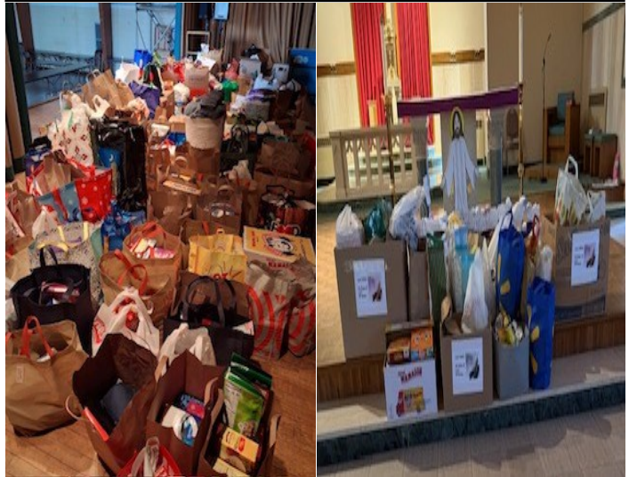
40 Days of Lent, 40 Items at Guardian Angels and St. Paul's