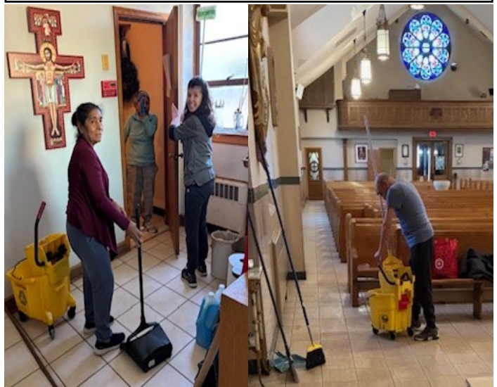
Church Cleaning for Easter, St. Paul's