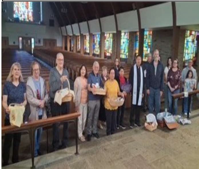
Easter Food Blessing at Guardian Angels Holy Saturday, April 4, 2026

eGiving lets you streamline your stewardship and support Transfiguration of the Lord Parish grow the ministries you care about most. eGiving provides steady, consistent support so we can empower our mission in support of our parish families and our community. Sign up at https://giving.parishsoft.com/app/giving/transfigurationhp or call their toll free number: (866)930-4774 x6.