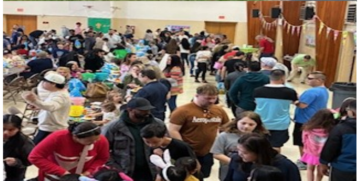
Easter Egg Hunt, Saturday, April 4, 2026. Thank you Knights of Columbus for organizing the Easter Egg Hung. The response was great!