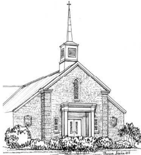
The Church of St. Martha Church Address: 260 Bonneville Rd. Stillwater , Pa.

Phone:.....570-736-6372 Fax:.....570-736-6232 Email:.....hsparish@pa.metrocast.net Friday Mass.....8:30 AM Sunday Morning Mass.....8:00 AM Holy Day Vigil Mass .....7:00 PM Confessions.....upon request