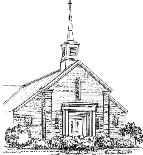
The Church of St. Martha Church Address: 260 Bonneville Rd. Stillwater , Pa.

Phone:.....570-736-6372 Fax:.....570-736-6232 Email:.....hsparish@pa.metrocast.net Friday Mass.....8:30 AM Sunday Morning Mass.....8:00 AM Holy Day Vigil Mass .....7:00 PM Confessions.....upon request