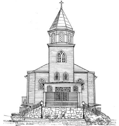
The Church of St. Mary Office: 150 Main St. Mocanaqua, Pa. 18655

Tuesday Mass.....8:30 AM Followed by Eucharistic Adoration .....9 AM to 9 PM Sunday Morning Mass.....9:45 AM Holy Day Mass.....6:00 PM Confessions.....upon request