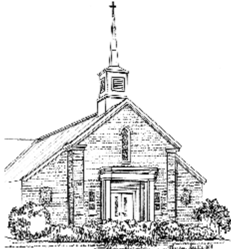
The Church of St. Martha Church Address: 260 Bonneville Rd. Stillwater , Pa.

Phone:.....570-736-6372 Fax:.....570-736-6232 Email:.....hsparish@pa.metrocast.net Friday Mass.....8:30 AM Sunday Morning Mass.....8:00 AM Holy Day Vigil Mass .....7:00 PM Confessions.....upon request