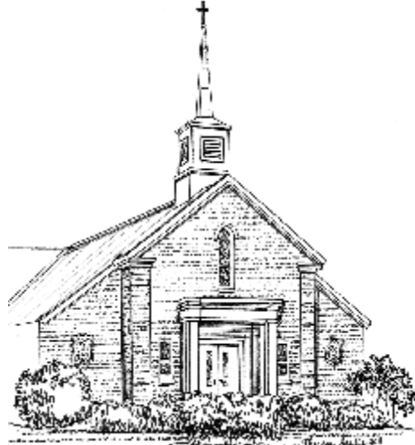
The Church of St. Martha Church Address: 260 Bonneville Rd. Stillwater, Pa.

Phone:.....570-736-6372 Fax:.....570-736-6232 Email:.....hsparish@pa.metrocast.net Friday Mass.....8:30 AM Sunday Morning Mass.....8:00 AM Holy Day Vigil Mass .....7:00 PM Confessions.....upon request