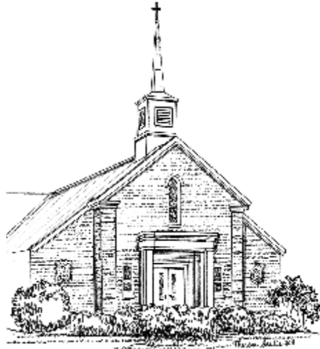
The Church of St. Martha Church Address: 260 Bonneville Rd. Stillwater, Pa.

Phone:.....570-736-6372 Fax:.....570-736-6232 Email:.....hsparish@pa.metrocast.net Friday Mass.....8:30 AM Sunday Morning Mass.....8:00 AM Holy Day Vigil Mass .....7:00 PM Confessions.....upon request