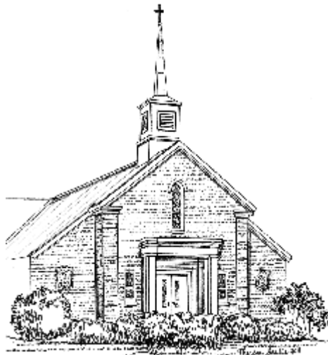
The Church of St. Martha Church Address: 260 Bonneville Rd. Stillwater, Pa.

Phone:.....570-736-6372 Fax:.....570-736-6232 Email:.....hsparish@pa.metrocast.net Friday Mass.....8:30 AM Sunday Morning Mass.....8:00 AM Holy Day Vigil Mass .....7:00 PM Confessions.....upon request