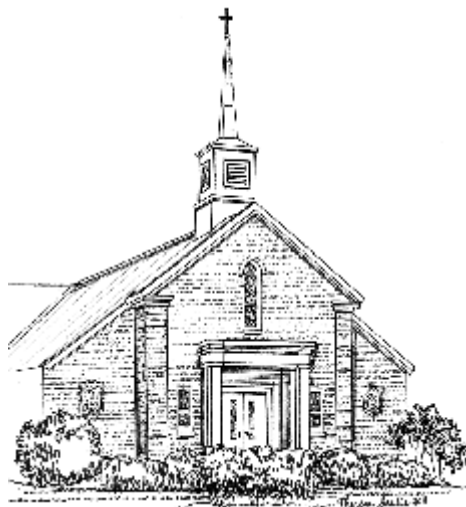
The Church of St. Martha Church Address: 260 Bonneville Rd. Stillwater, Pa.

Phone:.....570-736-6372 Fax:.....570-736-6232 Email:.....hsparish@pa.metrocast.net Friday Mass.....8:30 AM Sunday Morning Mass.....8:00 AM Holy Day Vigil Mass .....7:00 PM Confessions.....upon request