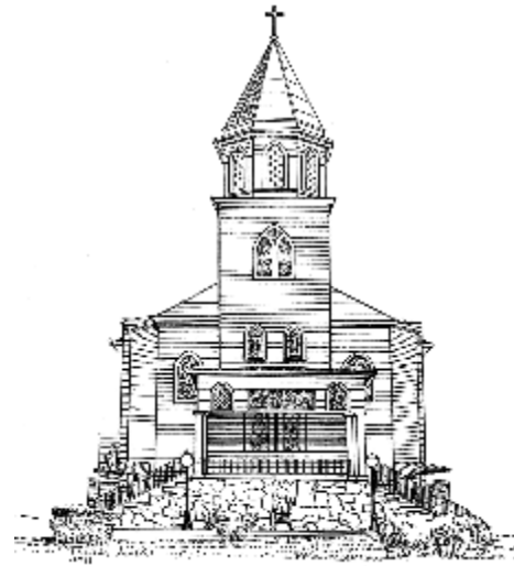
The Church of St. Mary Office: 150 Main St. Mocanaqua, Pa. 18655

Tuesday Mass.....8:30 AM Followed by Eucharistic Adoration .....9 AM to 9 PM Sunday Morning Mass.....9:45 AM Holy Day Mass.....6:00 PM Confessions.....upon request