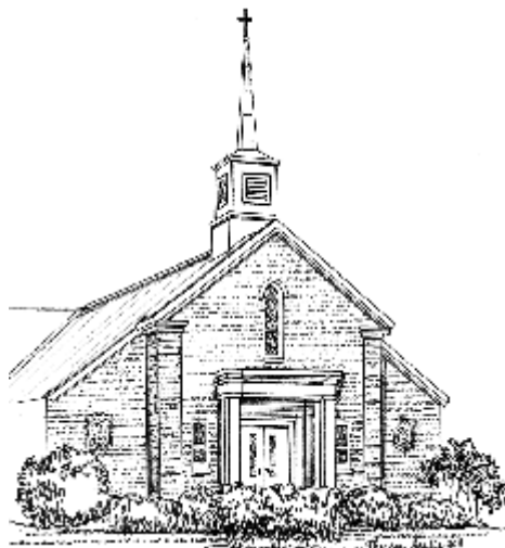
The Church of St. Martha Church Address: 260 Bonneville Rd. Stillwater, Pa.

Phone:.....570-736-6372 Fax:.....570-736-6232 Email:.....hsparish@pa.metrocast.net Friday Mass.....8:30 AM Sunday Morning Mass.....8:00 AM Holy Day Vigil Mass .....7:00 PM Confessions.....upon request