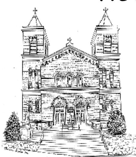
The Church of St. Adalbert Office: 31 S. Market St. Glen Lyon, Pa. 18617 Office Hours: Monday, Tuesday & Thursday 8:00 a.m. to 3:00 p.m.