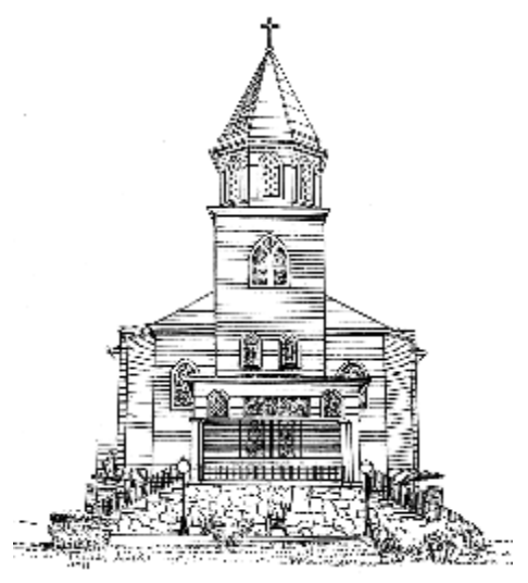
The Church of St. Mary Office: 150 Main St. Mocanaqua, Pa. 18655 Office hours: Wednesday 9:30 a.m. to 2:00 p.m.