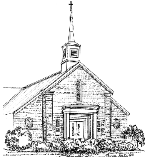
The Church of St. Martha Church Address: 260 Bonneville Rd. Stillwater, Pa.

Phone:.....570-736-6372 Fax:.....570-736-6232 Email:.....hsparish@pa.metrocast.net Friday Mass.....8:30 AM Sunday Morning Mass.....8:00 AM Holy Day Vigil Mass .....7:00 PM Confessions.....upon request