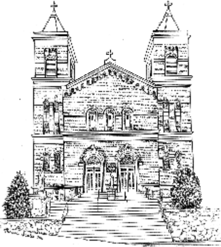
The Church of St. Adalbert Office: 31 S. Market St. Glen Lyon, Pa. 18617

Office Hours: Monday, Tuesday & Thursday 8:00 a.m. to 3:00 p.m.