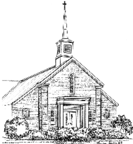
The Church of St. Martha Church Address: 260 Bonneville Rd. Stillwater, Pa.

Phone:.....570-736-6372 Fax:.....570-736-6232 Email:.....hsparish@pa.metrocast.net Friday Mass.....8:30 AM Sunday Morning Mass.....8:00 AM Holy Day Vigil Mass .....7:00 PM Confessions.....upon request