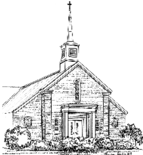
The Church of St. Martha Church Address: 260 Bonneville Rd. Stillwater, Pa.

Phone:.....570-736-6372 Fax:.....570-736-6232 Email:.....hsparish@pa.metrocast.net Friday Mass.....8:30 AM Sunday Morning Mass.....8:00 AM Holy Day Vigil Mass .....7:00 PM Confessions.....upon request