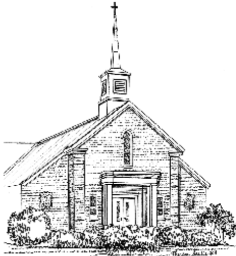
The Church of St. Martha Church Address: 260 Bonneville Rd. Stillwater, Pa.

Phone:.....570-736-6372 Fax:.....570-736-6232 Email:.....hsparish@pa.metrocast.net Friday Mass.....8:30 AM Sunday Morning Mass.....8:00 AM Holy Day Vigil Mass .....7:00 PM Confessions.....upon request