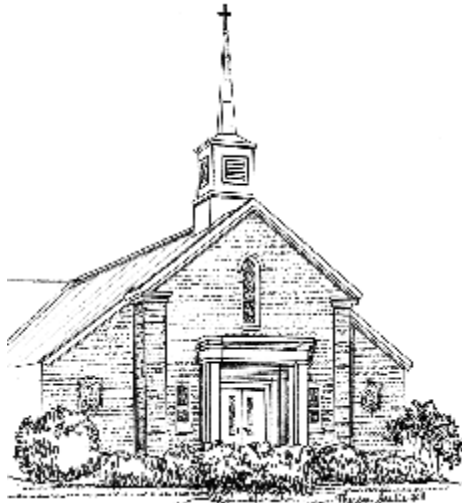
The Church of St. Martha Church Address: 260 Bonneville Rd. Stillwater, Pa.

Phone:.....570-736-6372 Fax:.....570-736-6232 Email:.....hsparish@pa.metrocast.net Friday Mass.....8:30 AM Sunday Morning Mass.....8:00 AM Holy Day Vigil Mass .....7:00 PM Confessions.....upon request