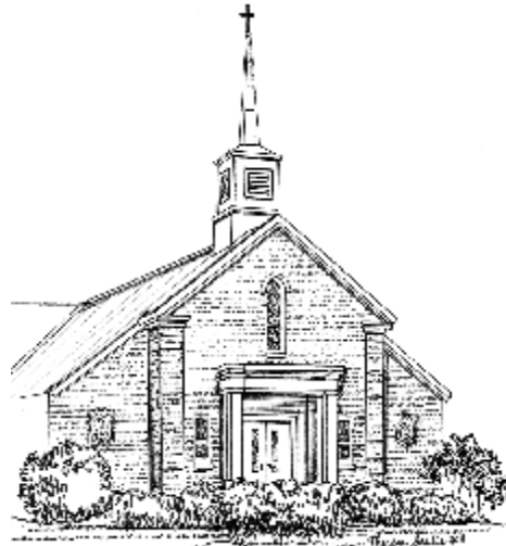
The Church of St. Martha Church Address: 260 Bonneville Rd. Stillwater, Pa.

Phone:.....570-736-6372 Fax:.....570-736-6232 Email:.....hsparish@pa.metrocast.net Friday Mass.....8:30 AM Sunday Morning Mass.....8:00 AM Holy Day Vigil Mass .....7:00 PM Confessions.....upon request