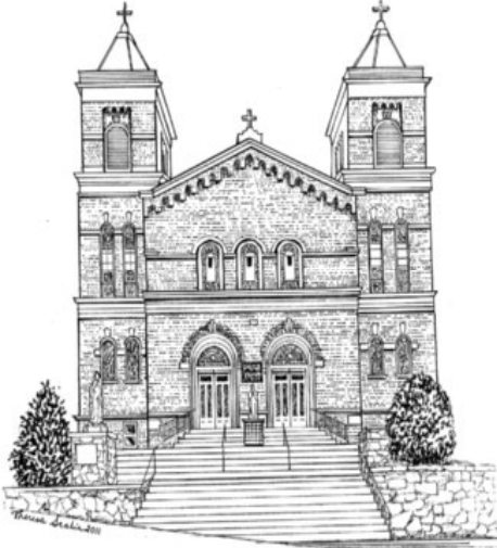
The Church of St. Adalbert Office: 31 S. Market St. Glen Lyon, Pa. 18617

Office Hours: Monday, Tuesday & Thursday 8:00 a.m. to 3:00 p.m.