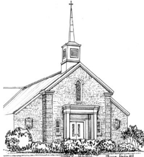
The Church of St. Martha Church Address: 260 Bonneville Rd. Stillwater, Pa.

Phone:.....570-736-6372 Fax:.....570-736-6232 Email:.....hsparish@pa.metrocast.net Friday Mass.....8:30 AM Sunday Morning Mass.....8:00 AM Holy Day Vigil Mass .....7:00 PM Confessions.....upon request