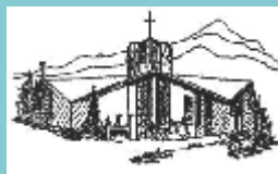
Divine Redeemer Catholic Church

Want to Join the Parish? Interested in Becoming Catholic? Been Away from the Faith too long? Please call the Parish Office at: (719) 633-5559