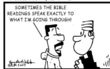
3RD SUNDAY IN ORDINARY TIME