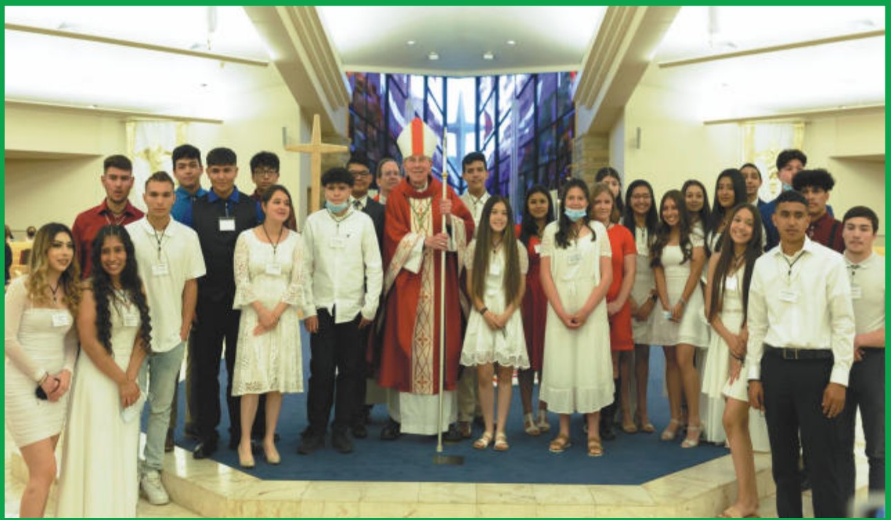
St. Joseph Confirmation 2021