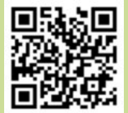
This is a QR-Code (Quick Response Code)

You can also use your smartphone to take a picture of the QR Code on the right and it will automatically link to the web address.