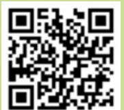
This is a QR-Code (Quick Response Code)

*If you have become a recurring donor and do not wish to receive paper envelopes through the mail please call the parish office at #505-265-5868.