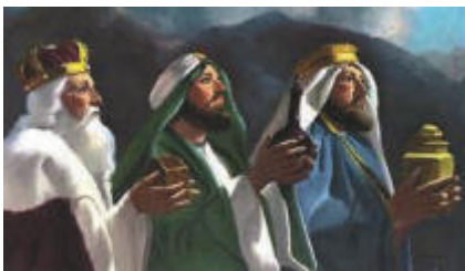
Gaspar, Melchior, Balthasar

Leccionario | © 1978 Comisión Episcopal de Pastoral Litúrgica de la Conferencia del Episcopado Mexicano.