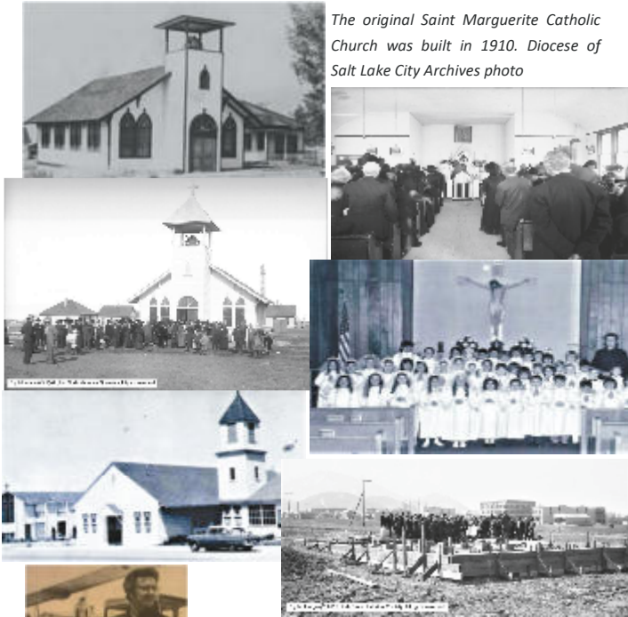
The original Saint Marguerite Catholic Church was built in 1910.