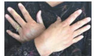
Arm crossing over chest to receive a blessing.