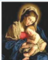
Mary, Mother of God

Padres y padrinos necesitan asistir a la clase de preparación. Los bautismos se lleva a cabo el tercer sábado del mes. El registro es obligatorio. Por favor pase por la oficina para registrarse. Si no hay nadie registrado, la clase será cancelado.