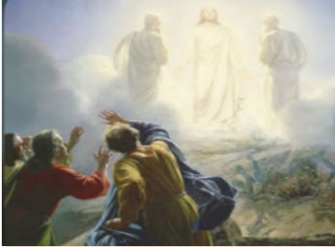
Luke 9, 28-36

Saturday: 235: MI 7:14-20 PS 103:1-12 LK 15:1-32