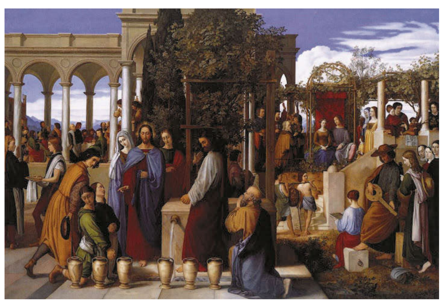
There was a wedding at Cana in Galilee, and the mother of Jesus was there. Jesus and His disciples were also invited to the weeding. When the wine ran short, the mother of Jesus said to Him, "they have no wine." Jn 2: 1-3