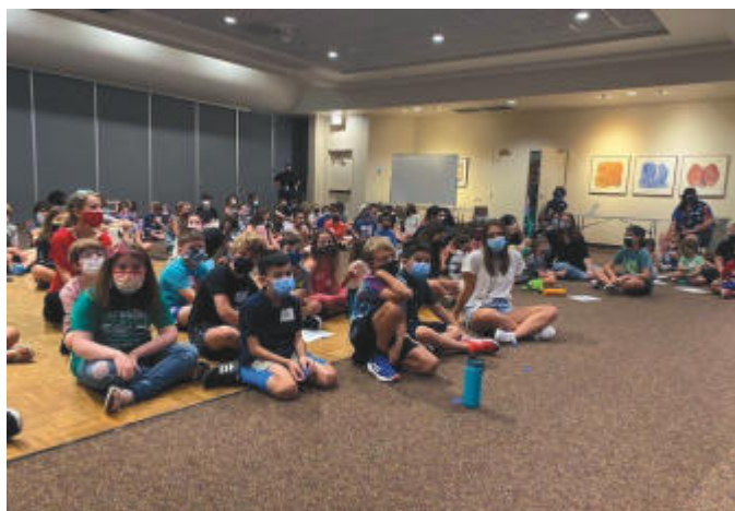
Raker Religious School is back in the building—with plenty of Ruah to go around!