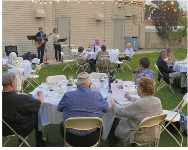
Second Night Community Seder