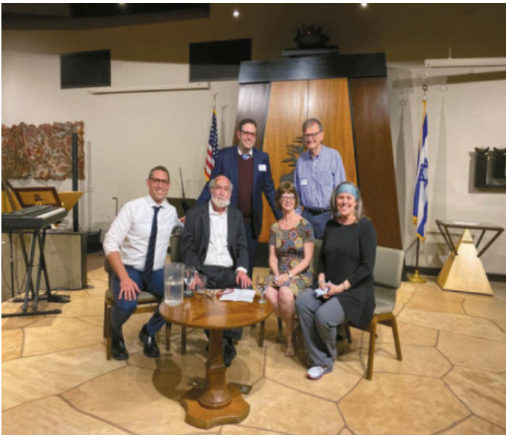
Rabbi Joseph Telushkin visits Temple Solel with Valley Beit Midrash