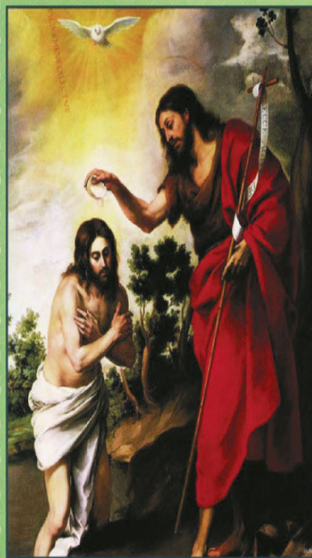
THE BAPTISM of the Lord

"I am baptizing you with water, but one mightier than I is coming. I am not worthy to loosen the thongs of his sandals. He will baptize you with the Holy Spirit and fire." - Lk 3:16c