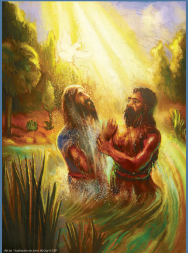
Art by / Ilustración de John McCoy © LTP

Confession Monday (January 24th, & 31st): 5:00–6:00pm (Gillette) Saturday: 3:00–4:30 pm (Gillette) or by appointment