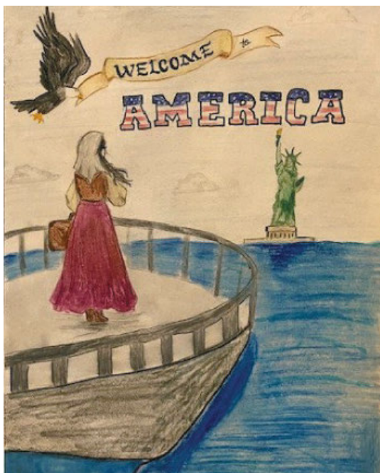
Artist: Greer Ottmann, 8th grade

8th-graders have been learning about immigration in the late 1800's and past immigration patterns in history.