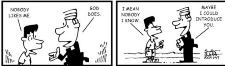
2ND SUNDAY IN ORDINARY TIME