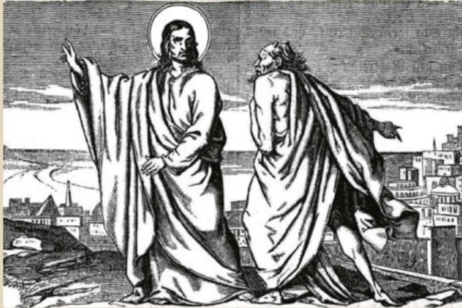
From The Liturgical Year , 1st Sunday of Lent by Dom Gueranger, O.S.B.

VERITATEM FACIENTES IN CARITATE - LIVING THE TRUTH IN CHARITY