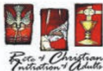
Rite of Christian Initiation of Adults

Las clases de CCD para grados 1 a secundaria, son los Miércoles de 5:45-7:00PM. Para inscripciones llamar a la oficina de la iglesia o registrarse al ir a la clase. Entregar copia del certificado de bautizo junto con la forma de registro. Hay una cuota de inscripción. Las familias que no tengan recursos para pagar, llamen a la oficina