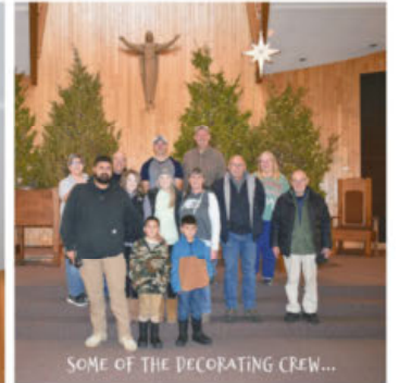
SOME OF THE DECORATING CREW...