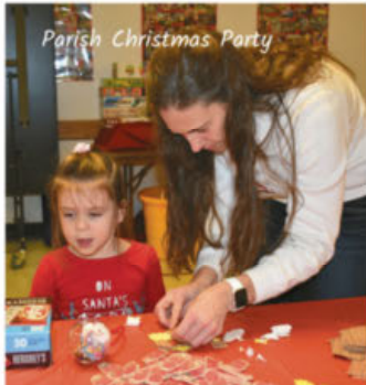
Parish Christmas Party