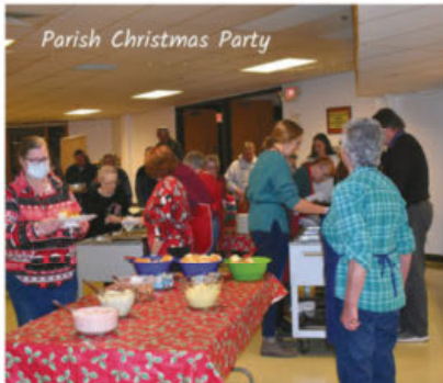
Parish Christmas Party