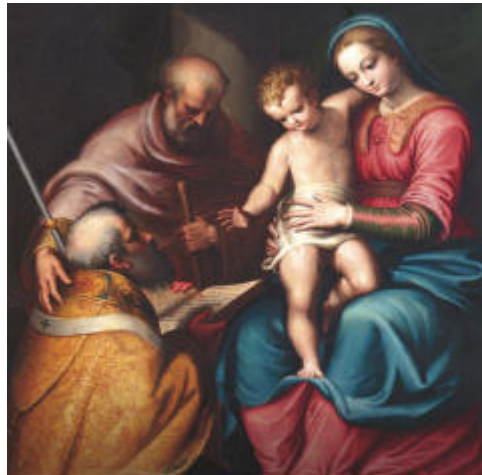
THE HOLY FAMILY

2201 The conjugal community is established upon the consent of the spouses. Marriage and the family are ordered to the good of the spouses and to the procreation and education of children. The love of the spouses and the begetting of children create among members of the same family personal relationships and primordial responsibilities.