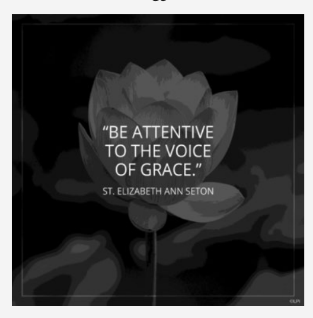
St. Elizabeth Ann Seton, the first citizen born in the United States to receive the title of "Saint" Feast day: Jan. 4