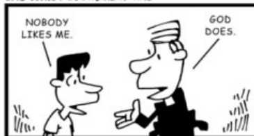
2ND SUNDAY IN ORDINARY TIME

01/02 ...$2,883.38 TOTAL COLLECTION FOR 2022... $4,094.38