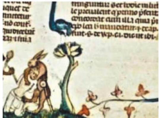
A whimsical Medieval Pieta depiction from an 11th Century illuminated manuscript shows Mary, depicted as a hare, holding the body of Jesus as he is taken down from the cross.

An Easter bunny who brings the Easter eggs, also is much more than a secular Easter symbol that has long been associated with Mary, the Mother of the Church. Christian art in early prayer books from the Middle Ages often had images of a rabbit or hare in the margins, invoking Mary. Even some of the tombs of martyrs, called catacombs from ancient Rome have crude depictions of rabbits painted on the walls like graffiti. This was a secret way of invoking our Mother Mary's protection over the tombs of the dead with symbols the Romans would not understand.