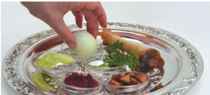
A traditional Passover seder plate

Despite what you might read on social media, Eggs and Bunnies have been symbols of the Easter story since the very early years of Christianity. The Egg was first used in Passover celebrations going back far before the time of Jesus as a symbol of the Jewish people during times of persecution. Rulers would try to turn the heat up on the Jews, so to speak, but that only made them stronger. A cooked egg is solid and does not break easily, a reminder to Jews celebrating Passover that they are made of stronger stuff than they think.