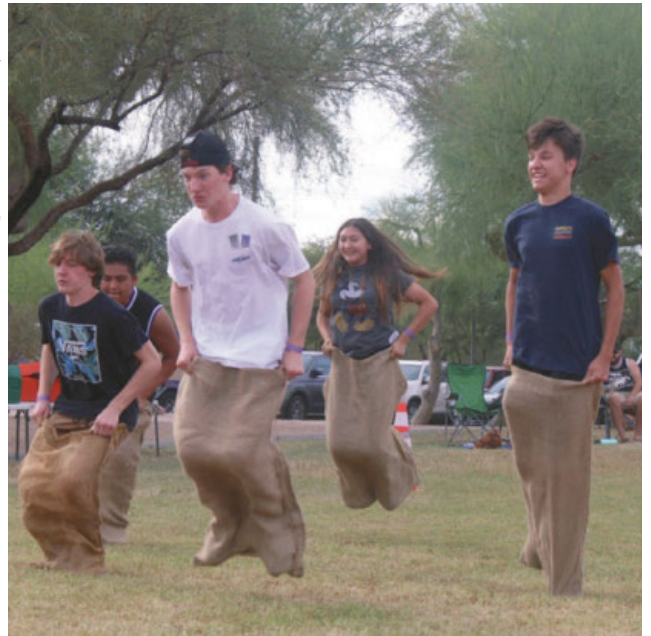
Our teens found a way to be both fashionable and intimidating in the sack race.