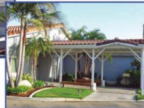
San Marcos Chapel

Every service is as unique as the life being celebrated. Whatever your choices are, we will help you create a memorable tribute for your loved one!