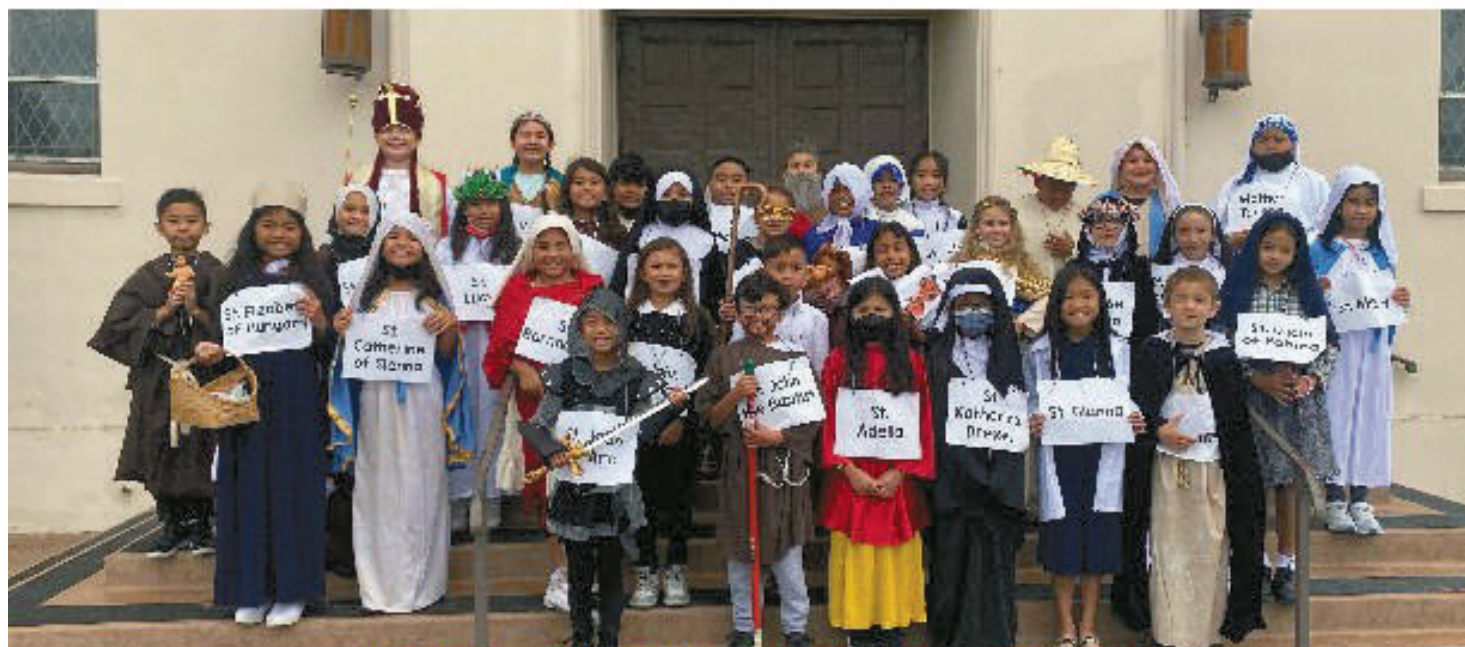
St. Joachim School Third Grade Saints