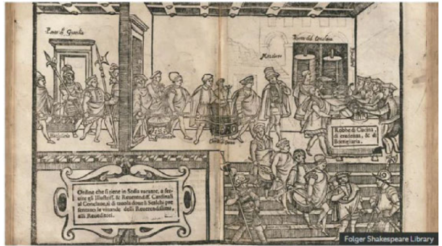
A 1605 image depicts the procession of stewards, guards and testers serving meals to the sequestered conclave through the "ruota"

over and the processing of choosing a new pope (conclave) is next. It has no firm timeline. When you read this column the new pope will probably have already been selected, but maybe not. Historically, selecting a new pope has taken hours, days, weeks and in the case of Pope Gregory X it took almost three years (1268 – 1271). The conclave goes on for as long as it takes for one cardinal to receive two-thirds of the vote. The conclave is a