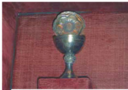
Shrine of the chalice, paten and Holy Blood of the miracle

In the Eucharistic Miracle of O'ebreiro, during the Mass, the Host that changed to Flesh and the wine to Blood was expelled from the chalice and stained corporal. The Lord performed this prodigy in order to sustain the little faith of the priest that did not believe in the Real Presence of Jesus in the Eucharist. To this day, the sacred relics of the miracle are guarded near the church where this prodigy took place and numerous pilgrims go there annually to give them praise.