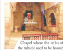
Chapel where the relics of the miracle used to be housed