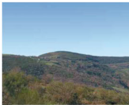
Panoramic view of O'ebreiro