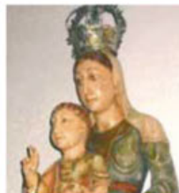
The Madonna of the Prodigy