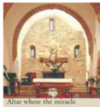
Altar where the miracle took place