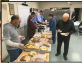
Assist at Parish functions...