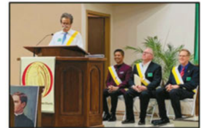
...Sharing our lay leadership skills

... Compartiendo nuestras habilidades de liderazgo