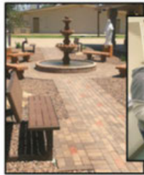
Annual Memorial Brick Campaign...

Su apoyo a nuestra rifa anual de Kof C ayuda a recaudar fondos para ministerios como nuestro Banco de Alimentos, y para mejorar las instalaciones.