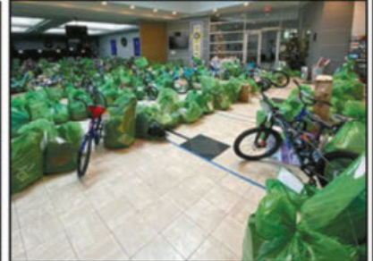
Salvation Army volunteers bagged gifts for each family using a coded system, then scheduled a three-shift pre-Christmas safe drive-thru pickup.

Christmas became a reality for 150 needy children in local families in December, thanks to the generosity of the parishioners of St. Charles Borromeo and our Knights of Columbus Council 11440. A total of 150 Angel Tree tags were taken and their requests fulfilled over a three-week period in Advent. More than 250 gifts were returned to the SCB altar, with a value of more than $5,000.