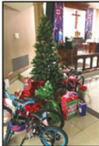
150+ Bagged Gifts (and several bikes) were returned to the altar...