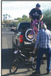
Knights & their family members loaded up the gifts from SCB and delivered them gifts in three separate trips to Sun City Salvation Army...