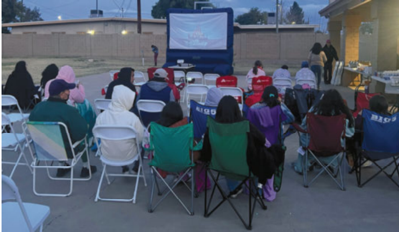
Gracias por venir a Nuestra Noche de Pelicula y Diversión Familiar

Our New Youth Ministry Coordinator Nuestra Nueva Coordinadora del Ministerio Juvenil